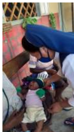
A mother brought her sick baby to the sister because of far away from the hospital