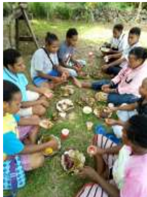
Social service in Papua