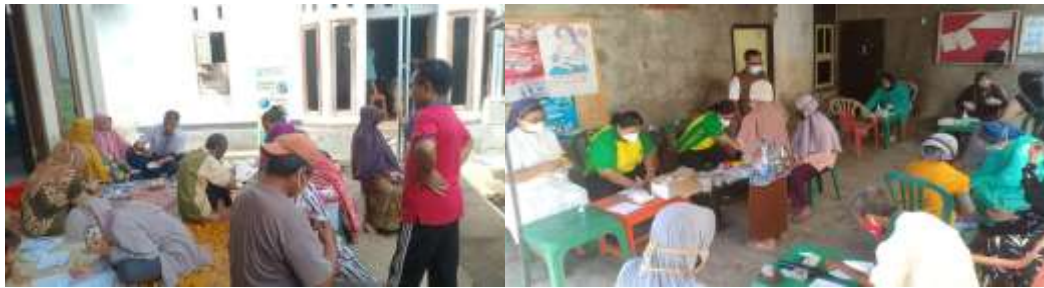
Social service in LOMBOK 2021 and free medication, health treatment