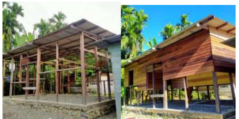
Renovation houses caused by rotten wood in Papua