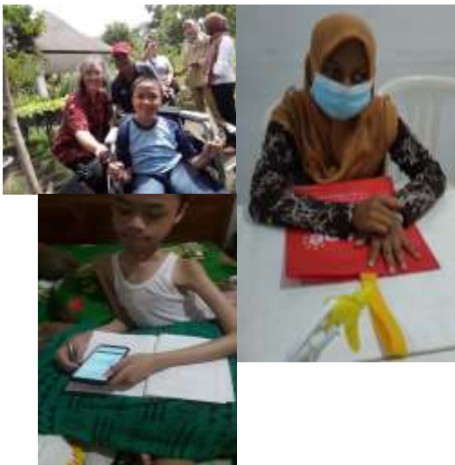
Disabled Children who need care and education fees