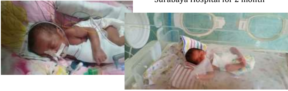
A premature baby cared by sister in RKZ Surabaya Hospital for 2 month