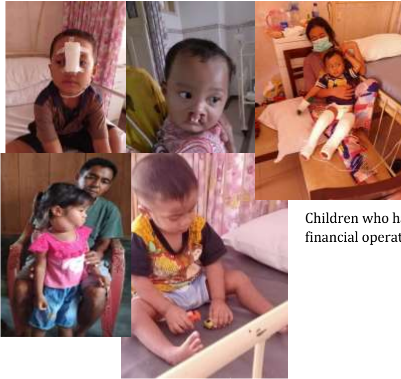
Children who have cared and helped their financial operation during 2021